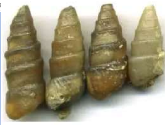
Silicified snail shells