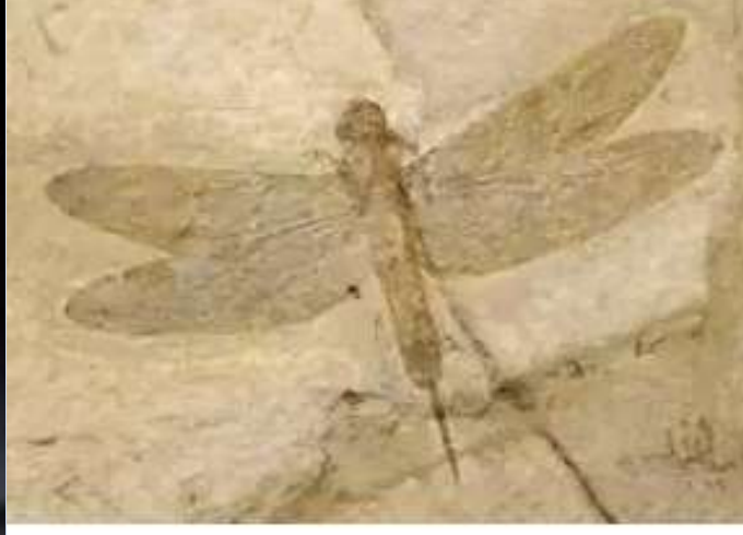
The exoskeletal body parts of arthropods fossilize better, making clear fossil records.