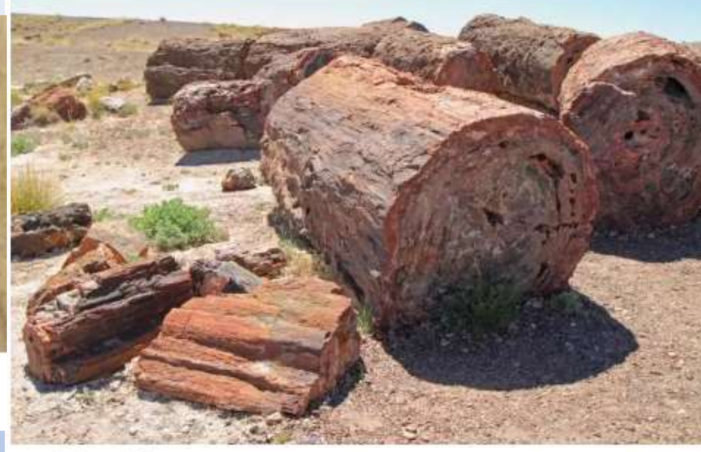
Petrified wood from Arizona. (Ima