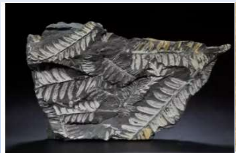
Carbonization is a common process involved with plant fossilization.